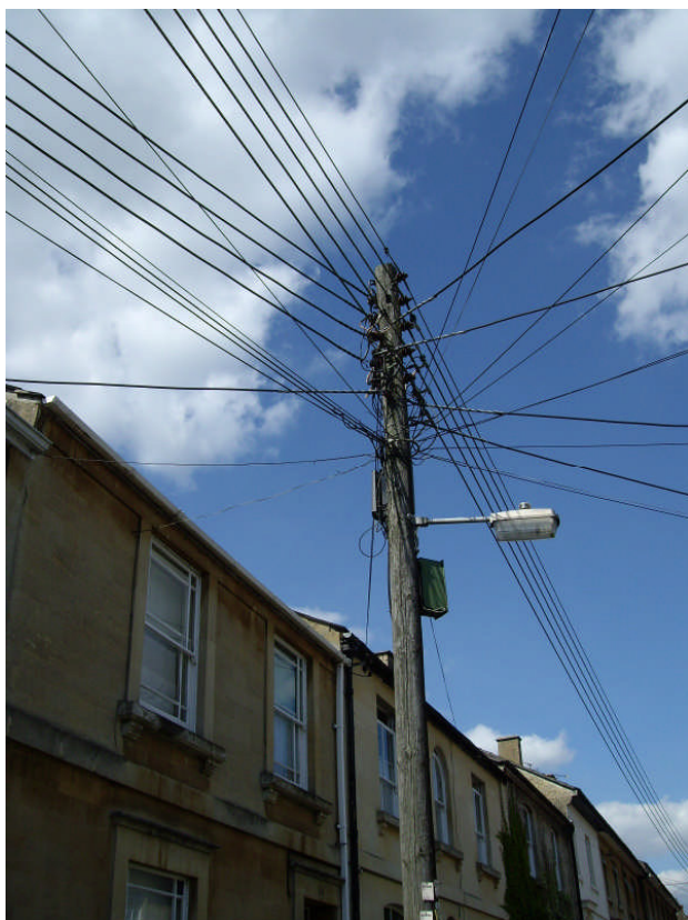
Fig 3 The diversion of service cables underground could have dramatic effect on the streetscape of St Paul Street.