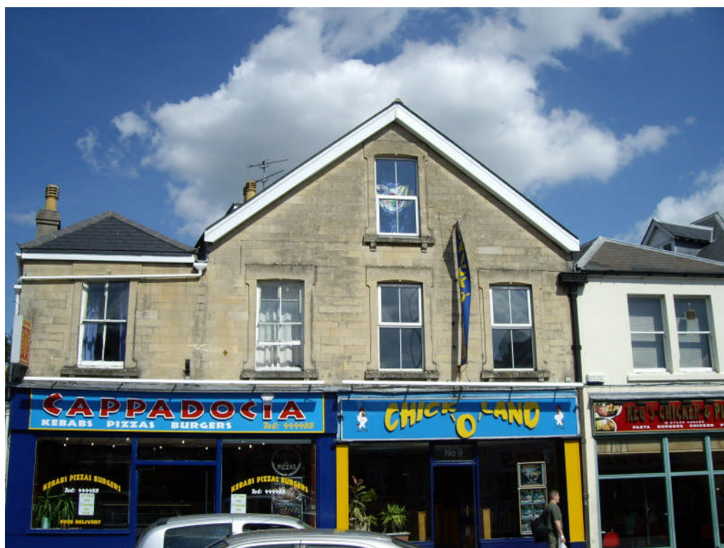
Fig 8: Many shopfronts would benefit from a grant scheme for enhancements appropriate to the buildings on which they are.

16. Improve the pedestrian environment by widening footpaths, creating safer crossing points, reducing corner radii etc.