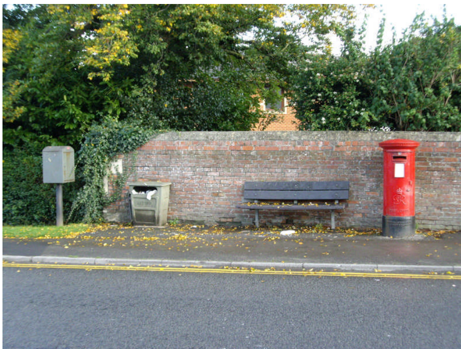
Fig 5: Opportunities exist to tidy up and rationalise street furniture