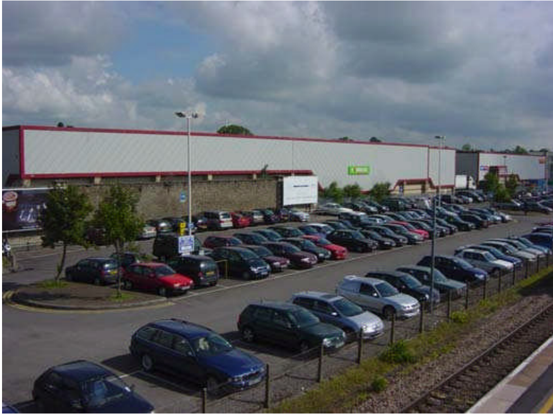
Existing situation at Chippenham Station car park north