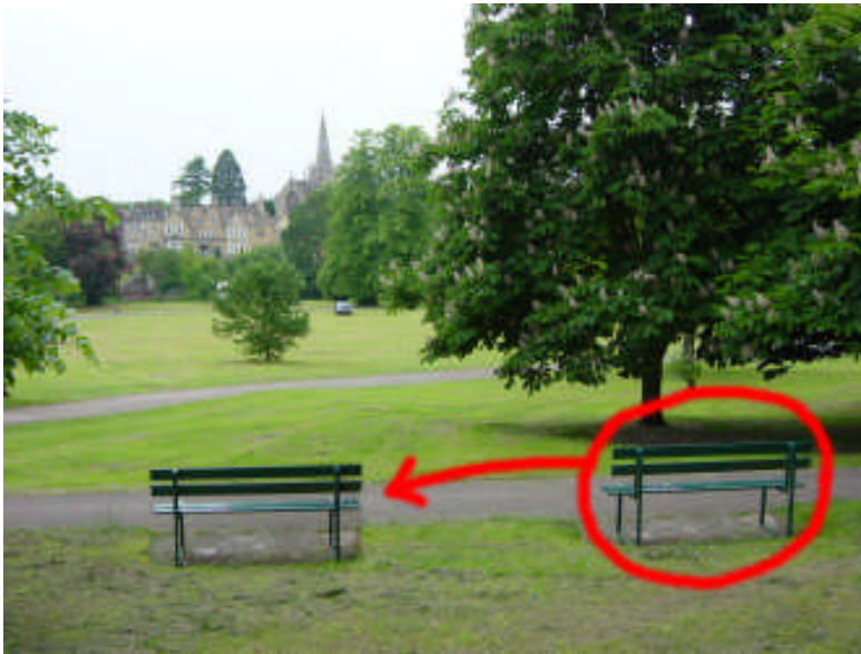
Fig11: This photomontage shows that by moving this seat to the left one of the most impressive views from the park of St Andrew's church and the properties along St Marys Street comes into view. The park's full potential for stunning views should be realised.