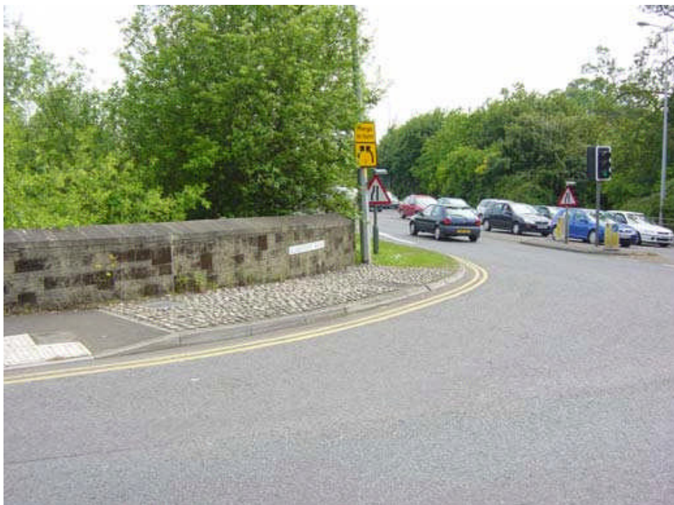
Fig 10: Spaces around Avenue La Fleche are dominated by vehicle provisions and barriers to pedestrians.

12. Improve pedestrian crossing points, desire lines and pedestrian / cyclist environment at the Avenue La Fleche and Gladstone Road junction, reducing the dominance of the motor vehicle ( Fig 10 ).