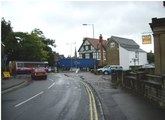
Fig.1 The Character Area is dominated by traffic during peak hours