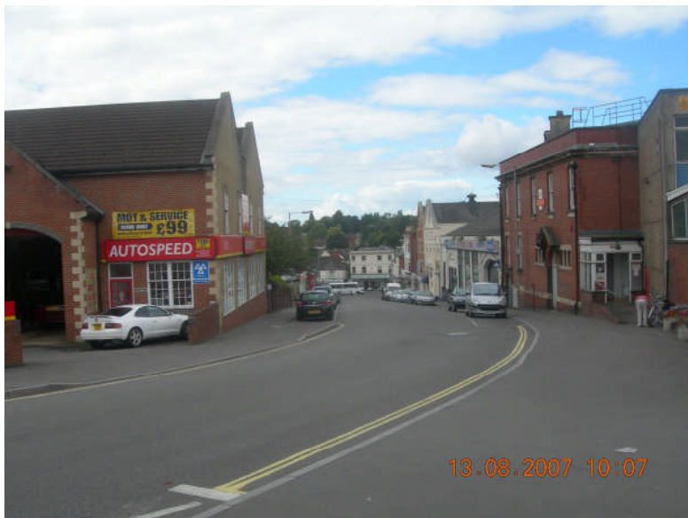
Fig 9 Station Hill, where blank areas of tarmac have replaced paving and a tree lined approach to the town centre