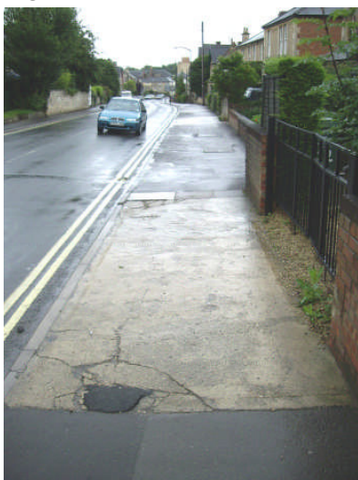
Fig.2 An example of poor footway surfacing in Marshfield Road