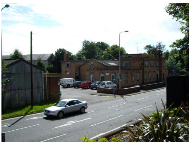
Fig 7: The several lanes of traffic which separate The Bridge Centre from the surrounding urban fabric.