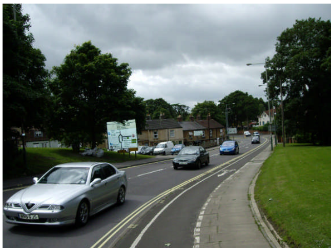
Fig 6: Heavy traffic on Ivy Lane