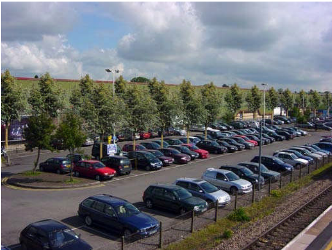
Fig 4: Carefully considered planting within the sizeable car park on the north side of the railway station could be used to screen the large blank rear elevation of the Hathaway Retail Park.