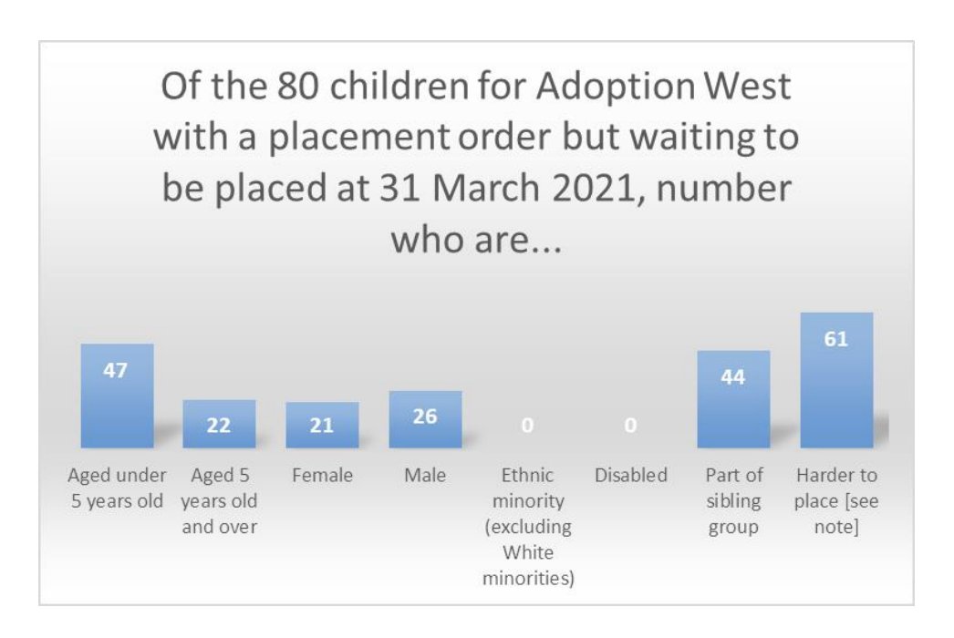
Note - "Harder to place" is defined as a child who is any of the following: 5 years or over, of an ethnic minority (excluding White minorities) background, disabled, or part of a sibling group. Children with more than one harder to place characteristic will be counted in each characteristic.