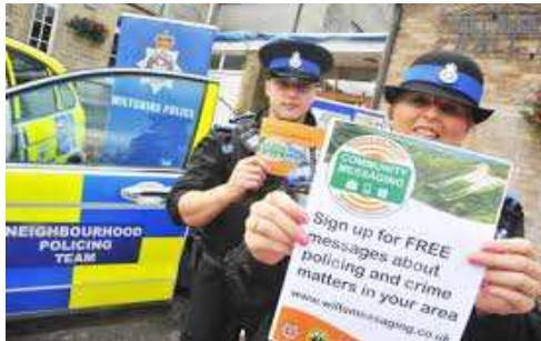
Neighbourhood Policing Teams