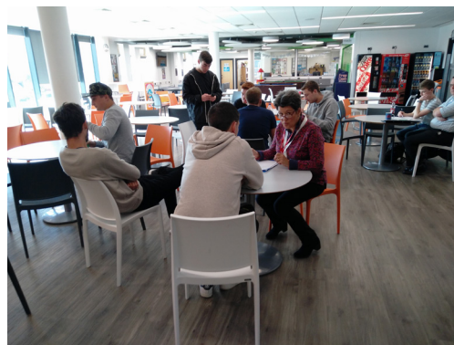
Speaking to students at Chippenham College