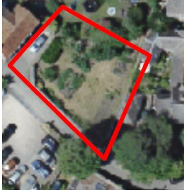
Figure 3: Overhead view of site

Figure 3 shows an overhead view of the site and demonstrates how cramped an area it is