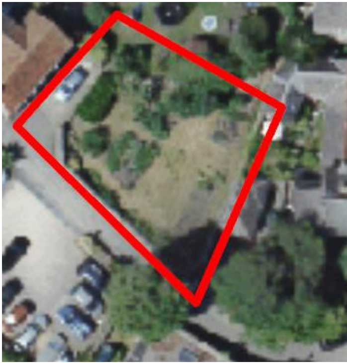
Figure 4 : existing garden will be lost