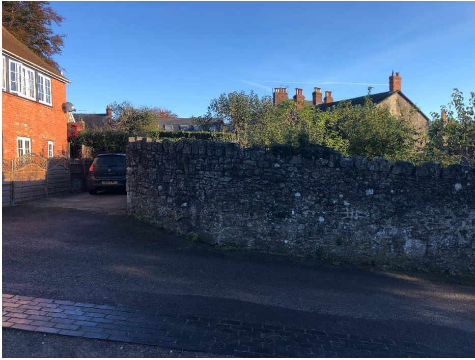
Figure 5: Southern aspect of Phoenix Cottage which will directly face the entrance to the new dwelling.