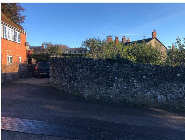
Figure 3: Ancient wall surrounding the site to be partly demolished

The proposed removal part of an ancient wall clearly breaches this policy. Significantly nowhere in the proposal or indeed in the officer’s report is it specified how much of the wall be knocked down leaving open the opportunity for a great deal of damage to be inflicted. We are puzzled why the officer chooses to ignore Tisbury’s made and up to date neighbourhood plan.