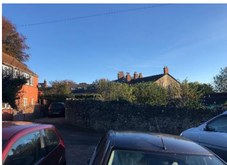
Figure 2: South Westerly aspect today

The sketch in Figure 1 shows the overbearing nature of this development . Its porch and window looks directly on to the southern side of Phoenix Cottage which is covered in windows causing very considerable loss of amenity. The building itself is only 6 metres from Phoenix Cottage while the new parking area is just a few feet away. We are at a loss to understand how the case officer can think this satisfactory for any resident including whoever occupies the new dwelling at Cleveland House. The photograph in Figure 2 shows the situation as of today . The change is dramatic .