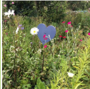
The rewilding area at Holy Trinity

news 18th September 2019 The Blue Heart at Holy Trinity in Bradford on Avon means it is re-wilding By Staff reporter