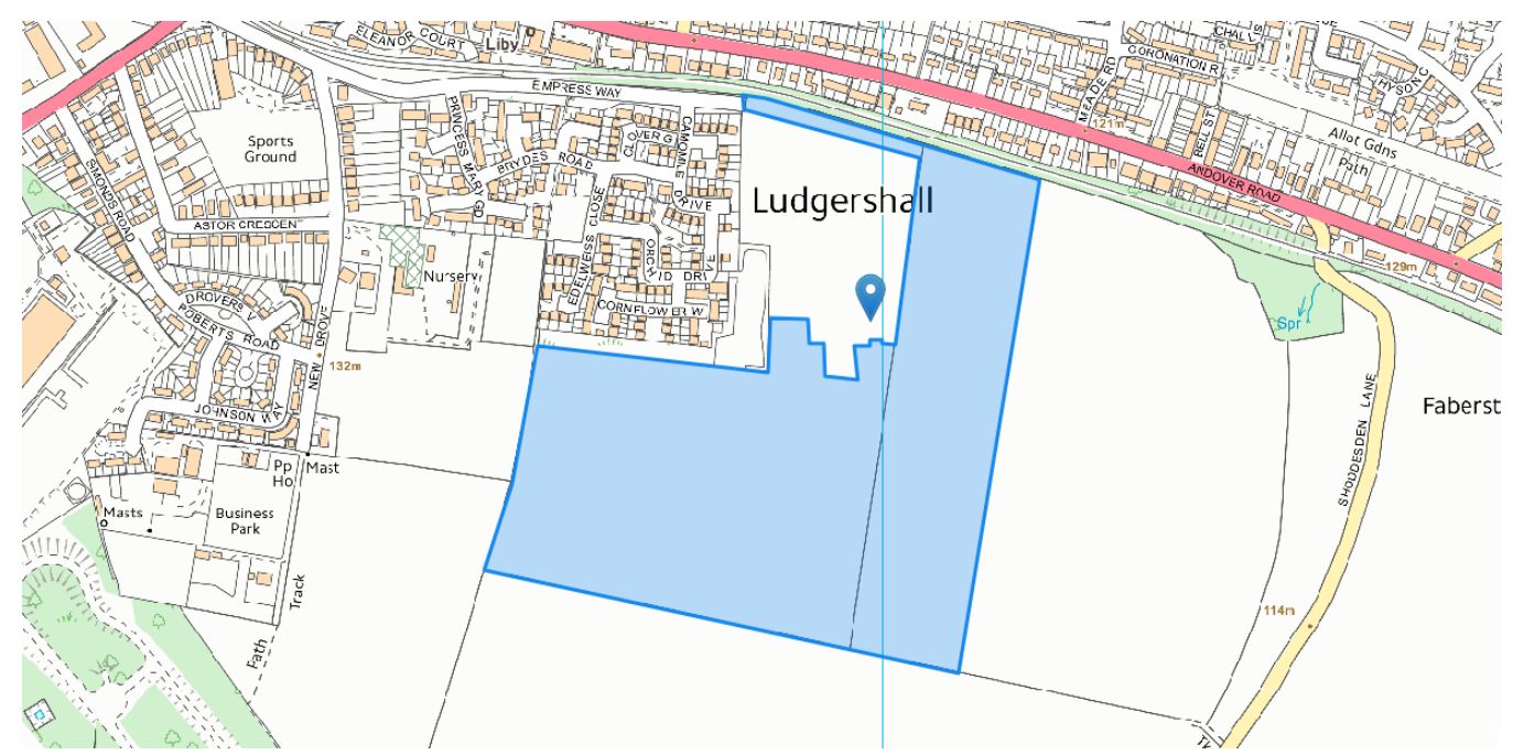
Figure 2 Detailed Site Location

Further to the north, beyond the railway, lies the wider built-up area of Ludgershall with a large employment area, the Castledown Business Park, located to the west of the A3026 Tidworth Road. The A3026 Tidworth Road and the Castledown Business Park site are located approximately 650m to the west, whilst the local shops and facilities on the A342 Andover Road are located approximately 650m to the north (Figures 1 and 2).