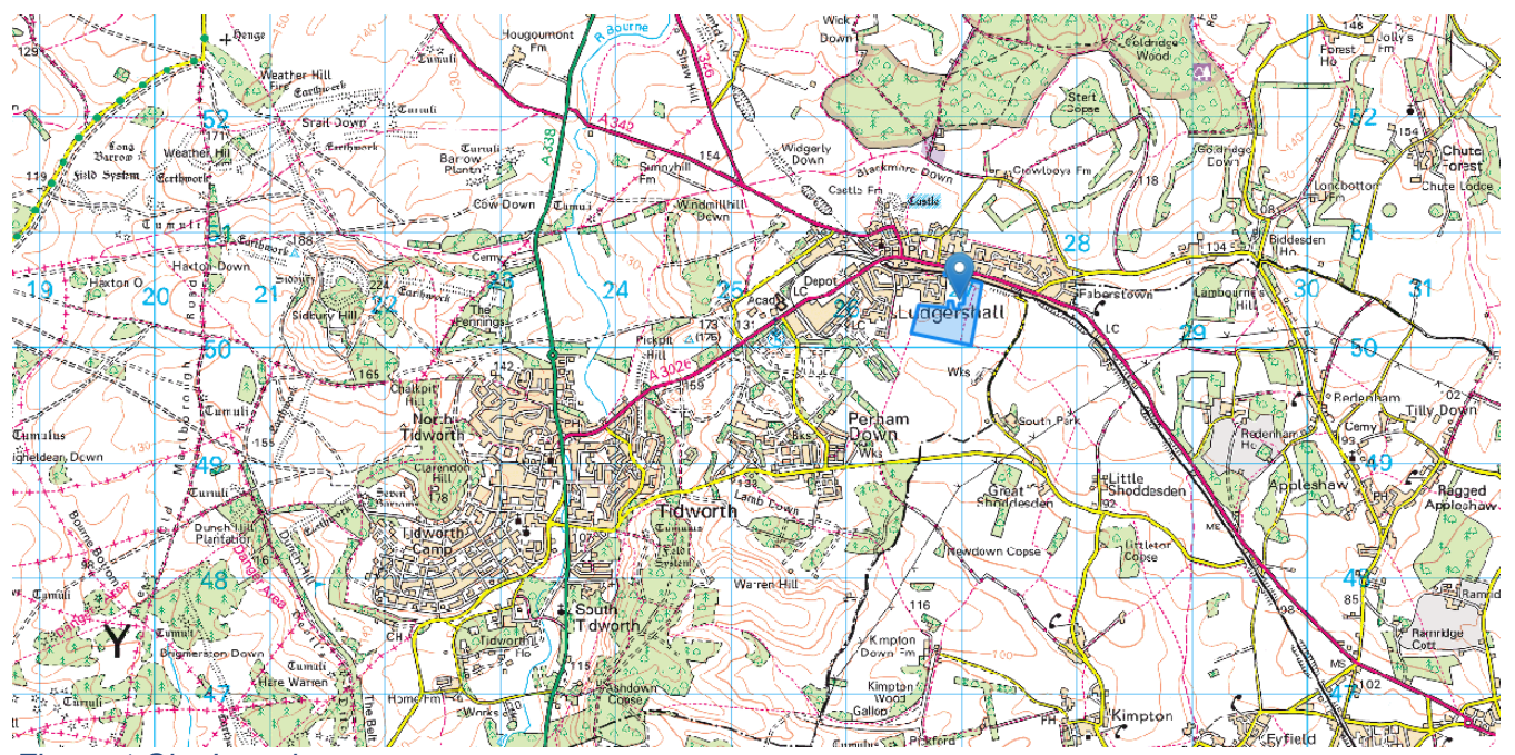
Figure 1 Site Location

The L-shaped Site comprises land in arable agricultural use (cereal cropping) and extends to approximately 12.8 hectares, and is located to the south of the railway line that runs parallel to Andover Road (A342). The Site is positioned at the south-eastern edge of the settlement at the far eastern end of Empress Way and wrapping around to the east and south of the housing estate formed by Princess Mary Gardens, Camomile Drive, Orchid Drive and Cornflower Way (Figures 1 and 2).