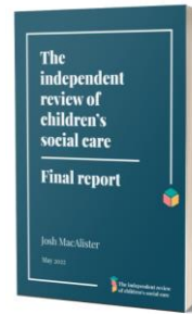
The Independent Review of Children’s Social Care

Three reviews were published last year, provided impetus and vision to transform children’s social care.