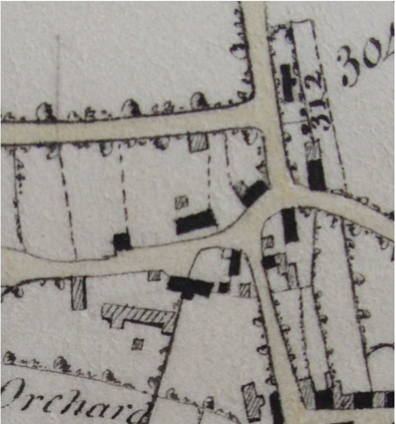
Claimed route closed at both ends and not shown as part of road network.