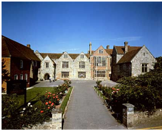
(Salisbury & South Wiltshire Museum King's House, 65 The Close, Salisbury)