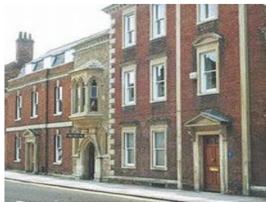
(Wiltshire Heritage Museum, 41 Long Street, Devizes)