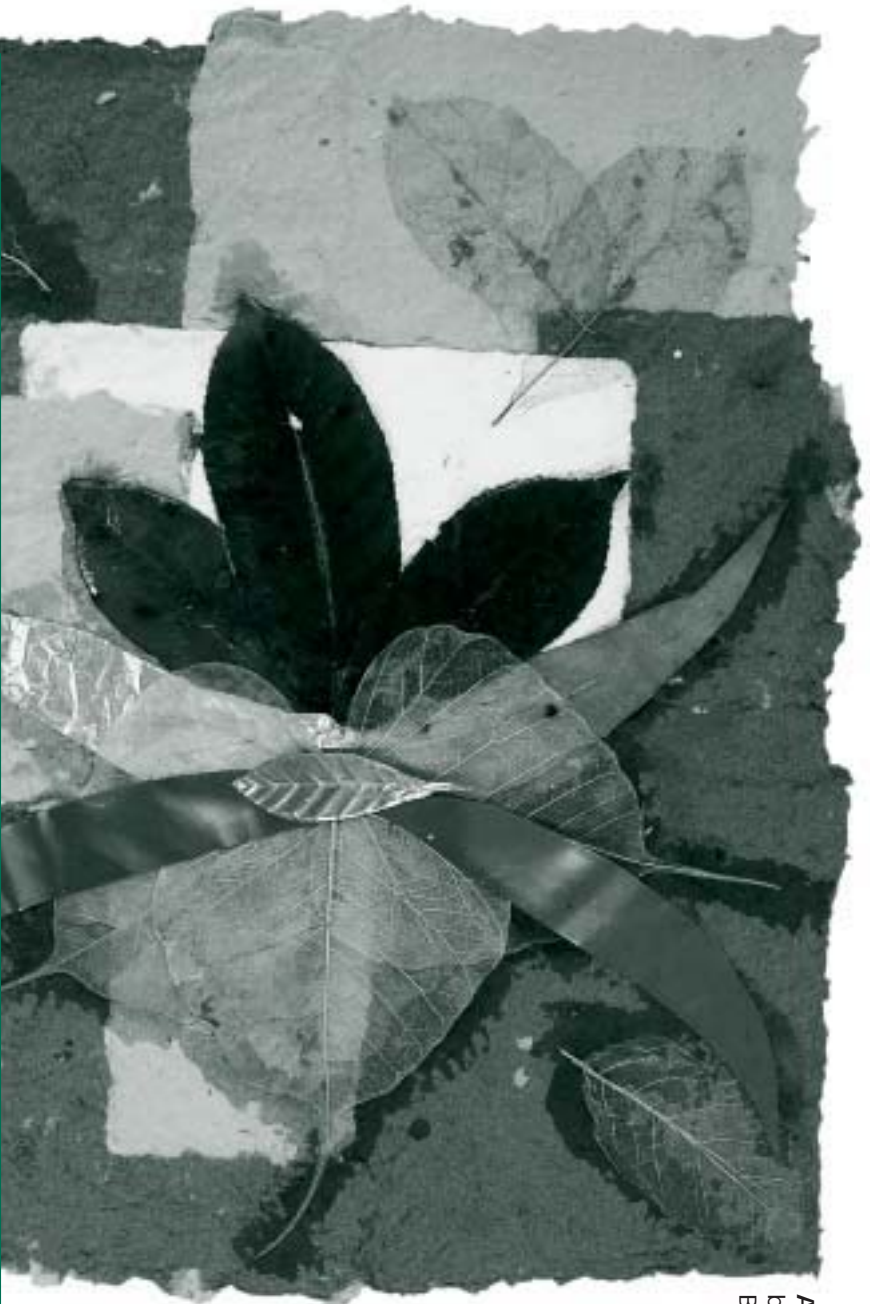
Autumn by Alabare at Barford St Martin