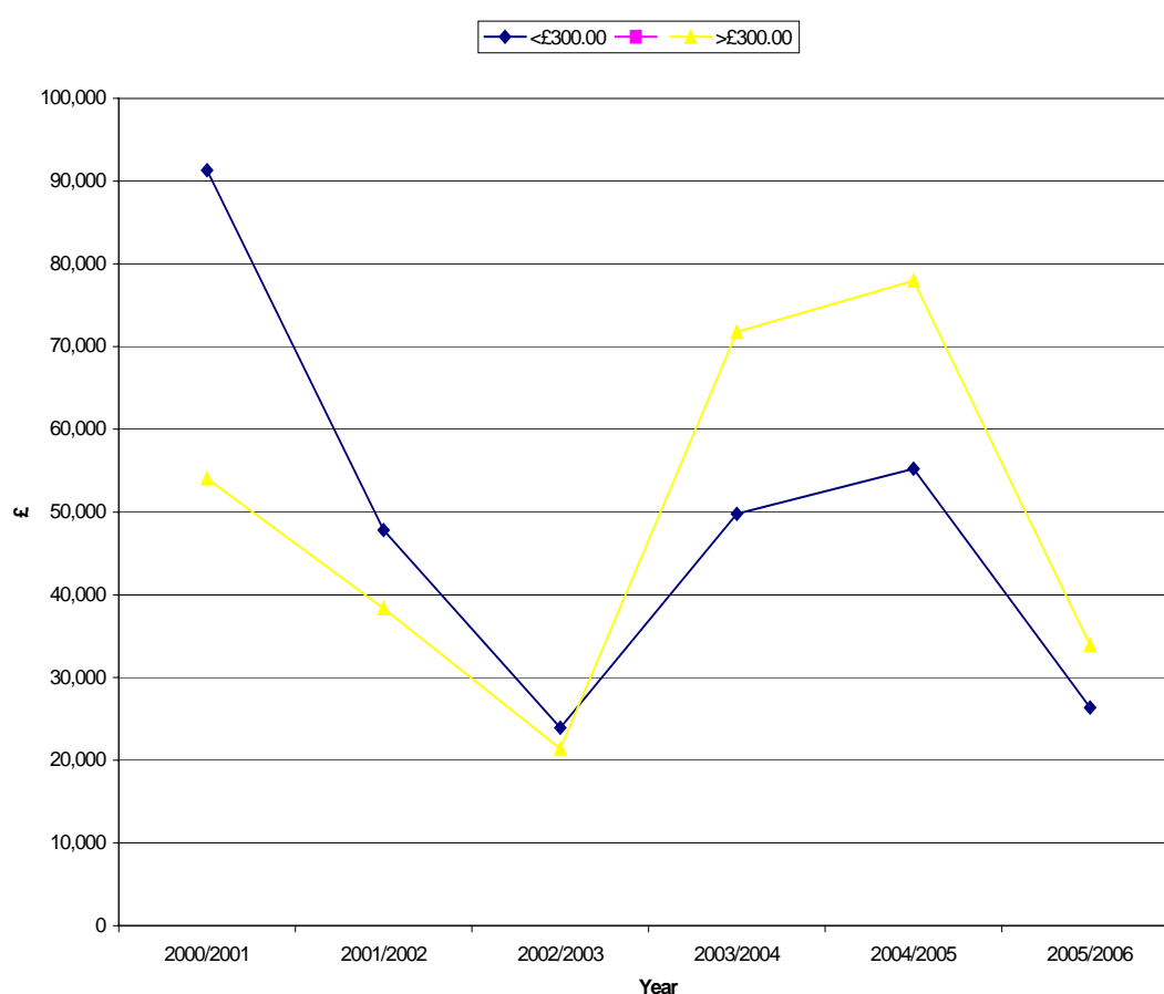
Council Tax Write Offs