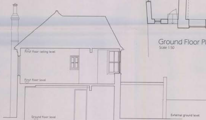
Section A-A Scale 1:50