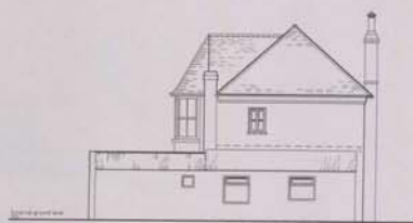
West Elevation Scale 1:100