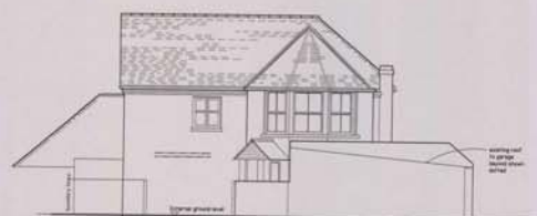
North Elevation Scale 1:100