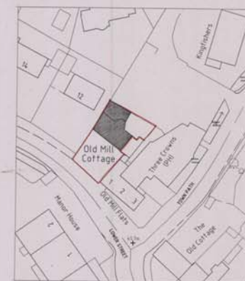
Location Plan Scale 1:500

Salisbury District Planning Department Recd. 18 FEB 2004 Acknowledged Copy to Action