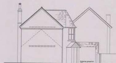
East Elevation Scale 1:100