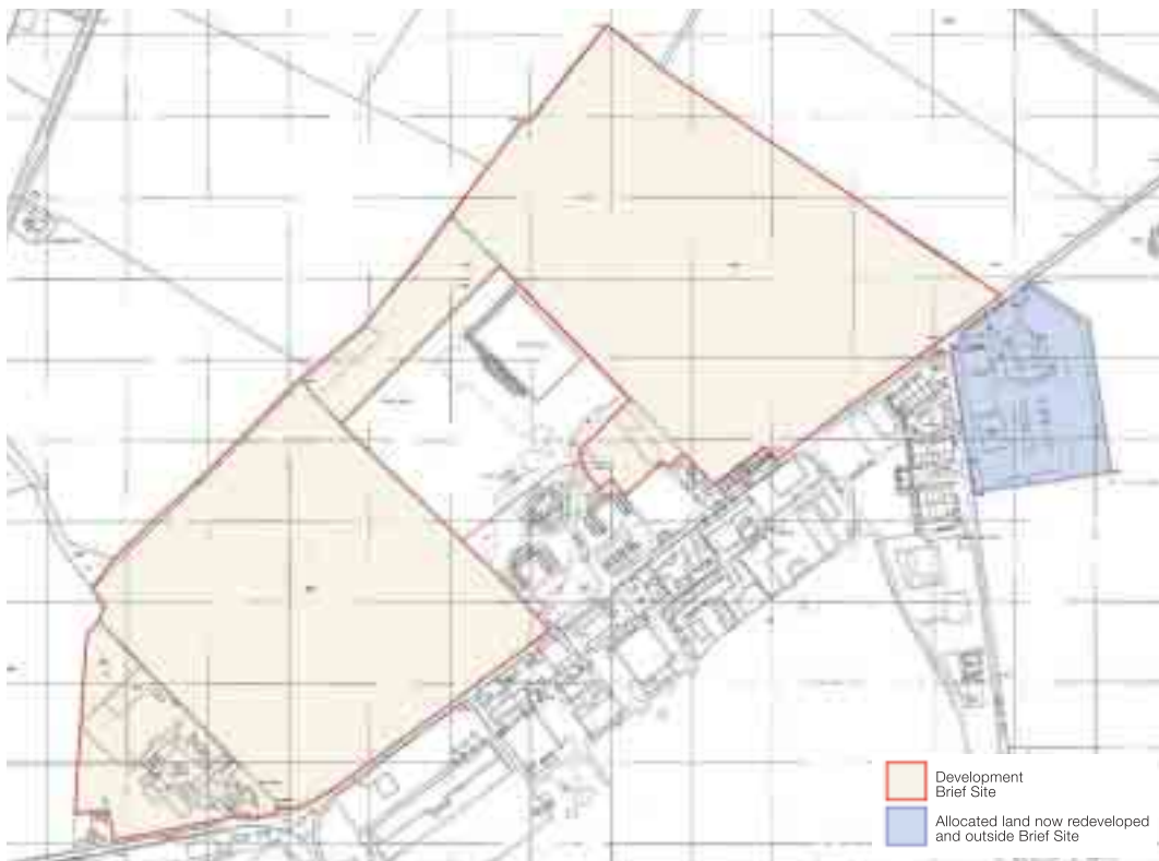
FIG 1.3 DEVELOPMENT BRIEF SITE