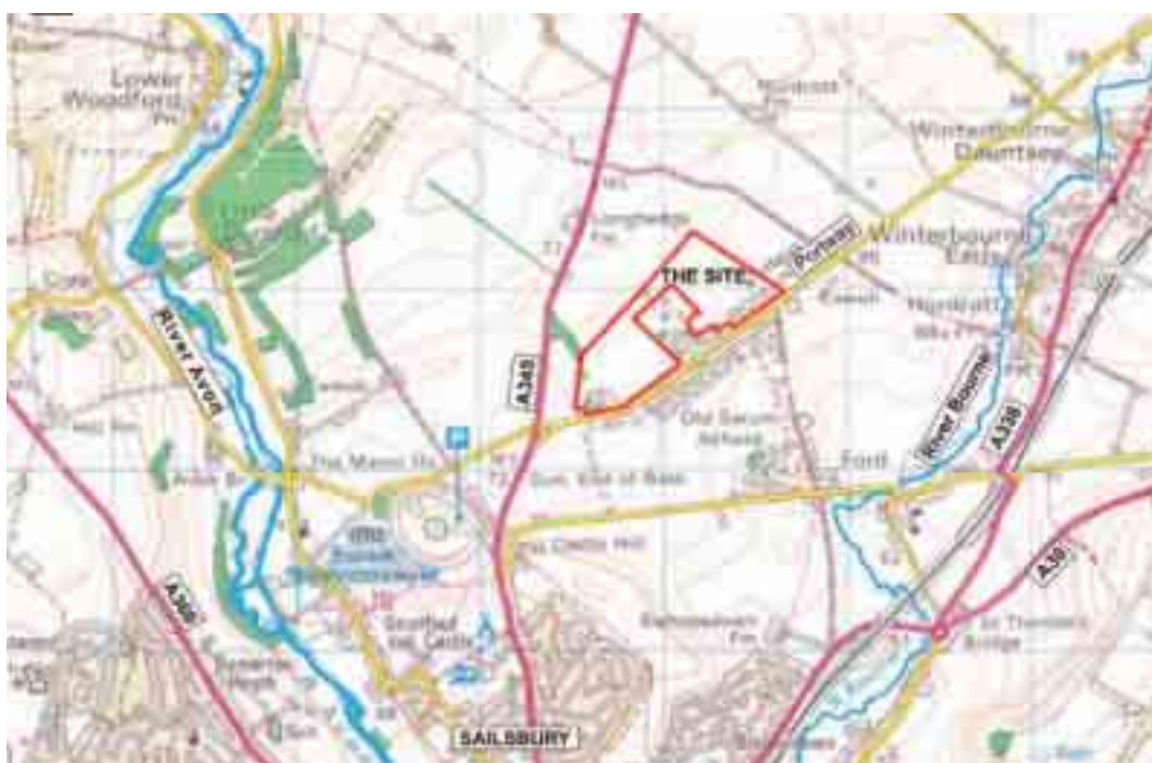
FIG 1.1 SITE LOCATION PLAN