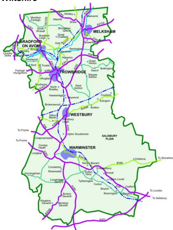
Figure 1: West Wiltshire