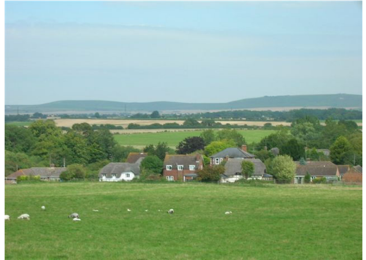
Tree viewed from nearby public areas