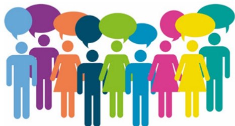
9 Dementia Advisers in Wiltshire

Wiltshire Clinical Commissioning Group (Wiltshire CCG) and Wiltshire Council say work has and continues to be planned, delivered and reviewed around each area that has been commented on by the public in the Healthwatch Wiltshire report.