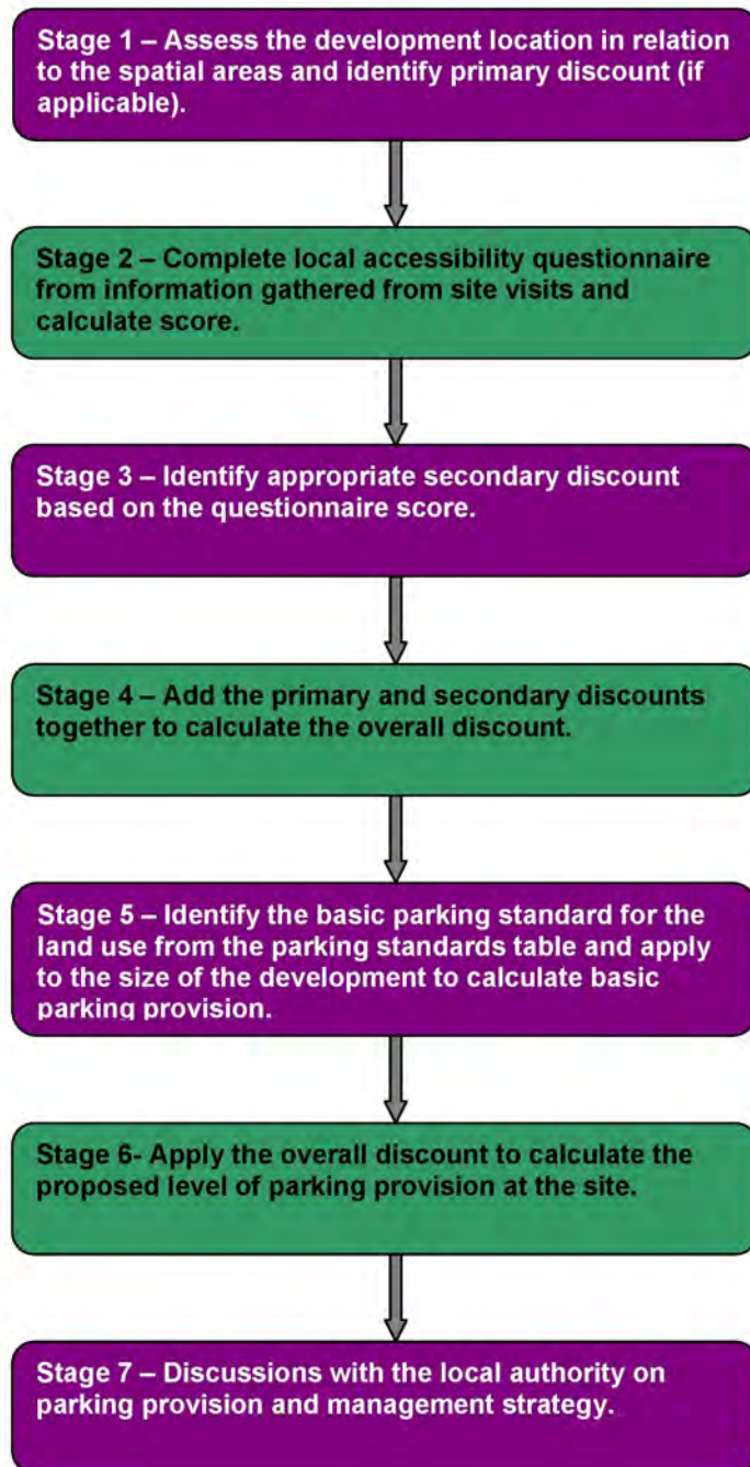
Figure 7.1 Discount processing diagram