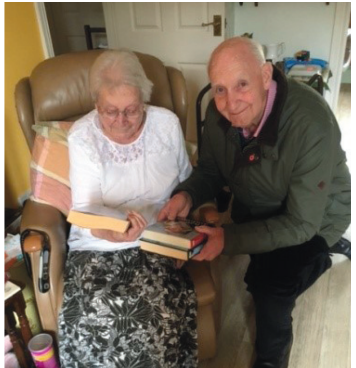
Users of the mobile library service

Providing additional resources for specific occasions, such as Holocaust Memorial Day and LGBT+ History month, such as topic-specific reading lists and