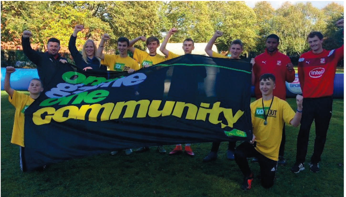
Participants in one of the Kick It Out events in 2018