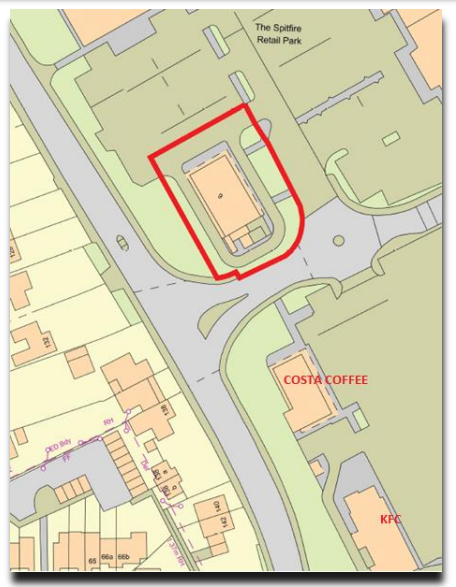
Site Location Plan with Costa Coffee and KFC to the south