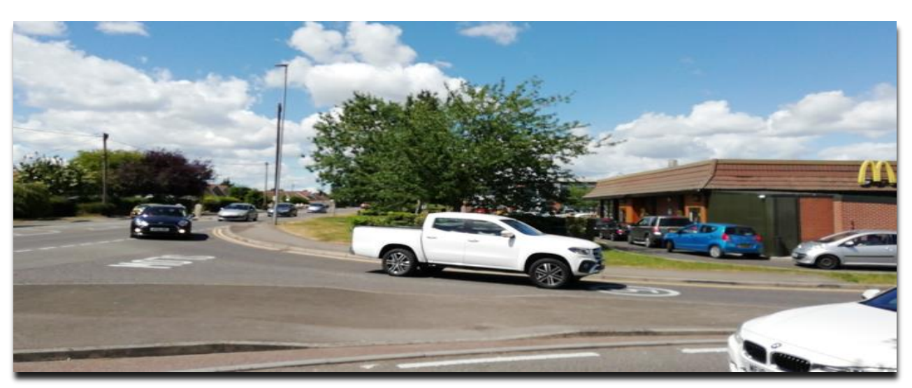
The MacDonald's consented Drive-Thru facility