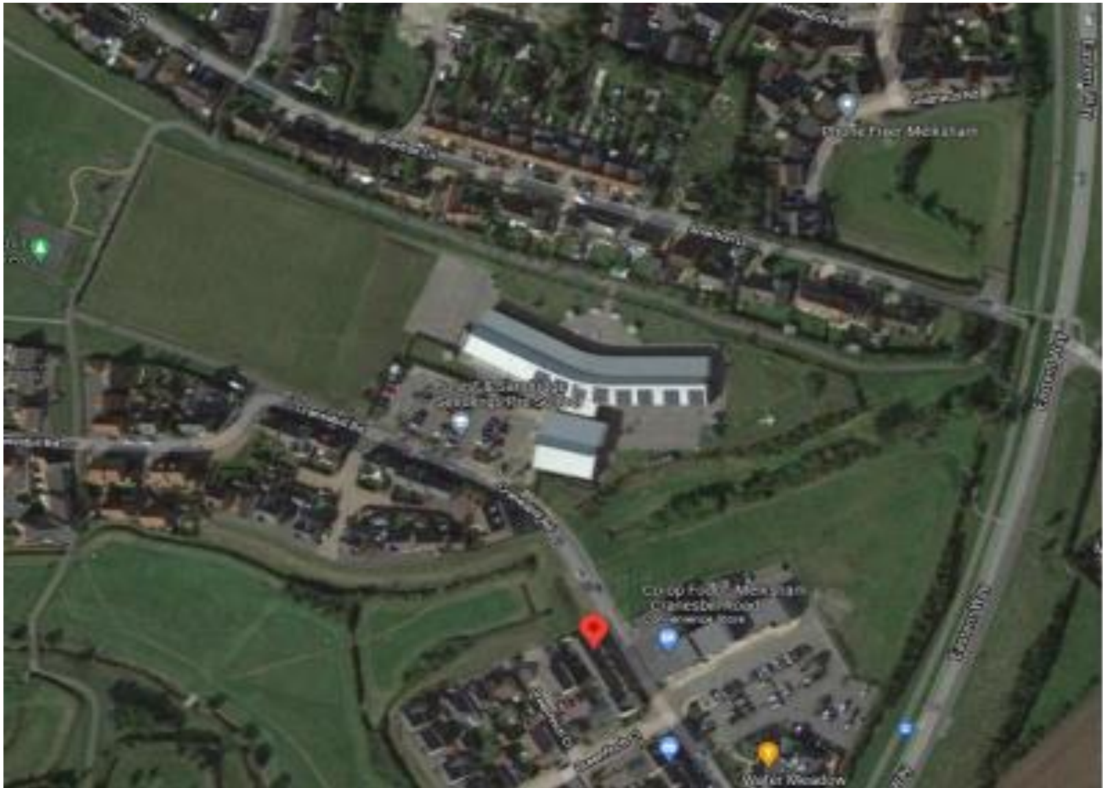
Aerial view of School site and immediate surroundings