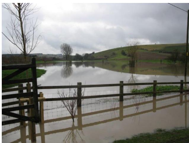
Flooding on the water meadows at Whitecliff Farm

A large number of responses registered concern about the River Wylde, mostly about maintenance and slightly fewer, about the possibility of flooding. 8 people volunteered to be part of a Flood Warden Group. Consultation events highlighted further concern about water levels and river flow being affected by abstraction of water. It has been established that the Environment Agency closely monitor and control water abstraction by Wessex Water which is from underground aquifers, not from the river. The Environment Agency monitors and maintains water levels and flow by pumping water into the river.