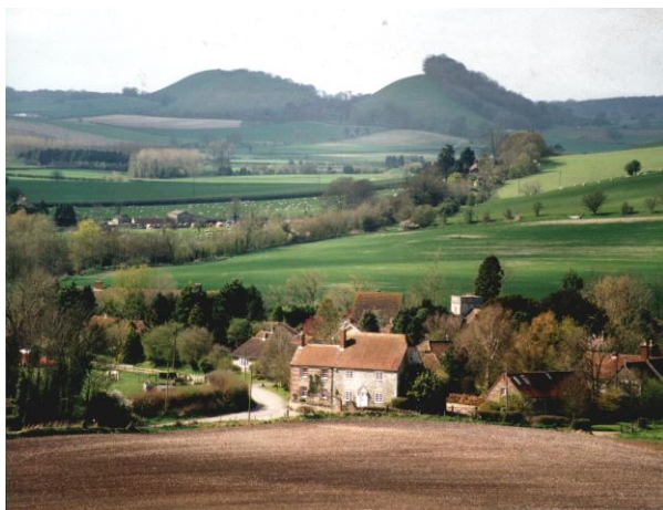
Monkton Deverill looking towards Long Knoll and Little Knoll

Cranborne Chase and West Wiltshire Downs Area of Outstanding Natural Beauty (AONB) Management Plan. The Upper Deverills Parish lies at the North West limit of the AONB area. This “national” designation is intended to protect the very special landscape, environment and communities in which we live. A key aspect of this “protection” is to conserve and enhance those special characteristics which are fundamental to the designation as an AONB. It is also to meet the demand for recreation, although that is not a formal objective within the designation. Being within the AONB boundary is a major contributor to maintaining the beauty of the Parish.