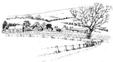
Monkton Deverill

Burton Farmhouse Manor Farmhouse The Old School 86 Monkton Deverill Former Church (St Alfred the Great) and Whiting monument