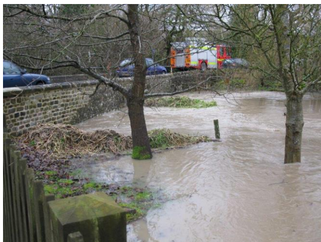
The river in flood at Brixton Deverill bridge 2008

greater interest in Monkton Deverill, albeit still a minority, compared to the other 2 villages.