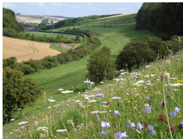
Looking north along the Lynchets at Monkton Deverill by Louise Stratton

NB - A water discharge exemption is required for weed cutting and can be obtained by contacting the Environment Agency’s National Customer Contact Centre on 08708 506 506 or from the Environment Agency website www.environment-agency.gov.uk .