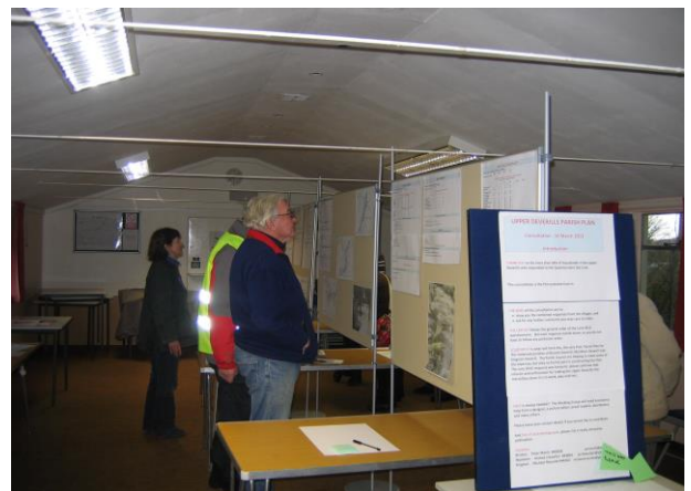
Questionnaire Feedback Event in the Village Hall 16 March 2013

Parish Plan Working Group. The Parish Council appointed a small Working Group of 3 volunteers in November 2012 to begin preparation of the plan.