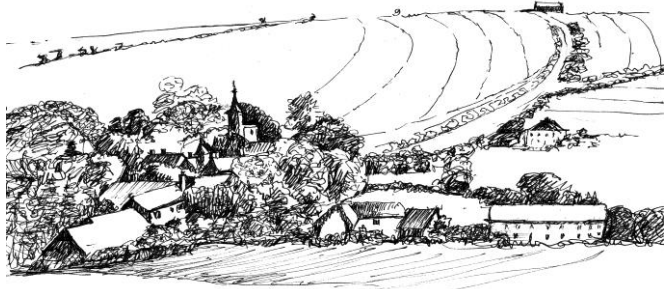
Kingston Deverill from the NW