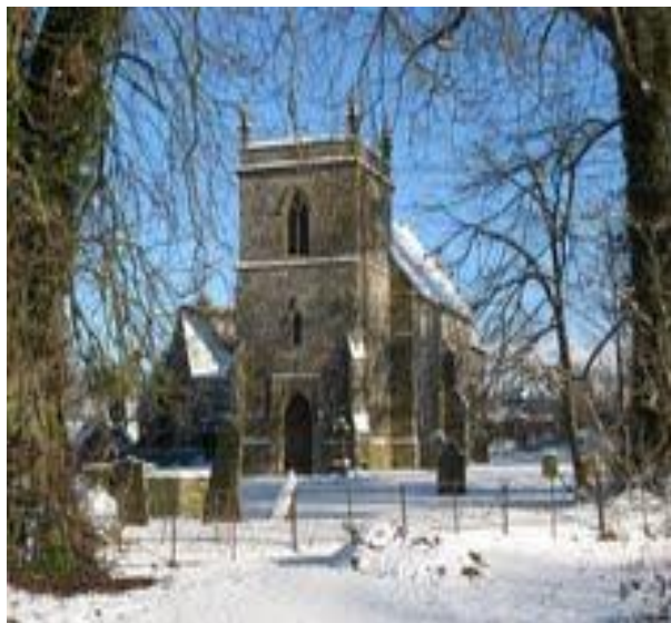
Brixton Deverill Church

With few facilities in the immediate area, residents look to Warminster and Mere for local services. Salisbury and Bath offer a wider range of facilities and can be reached by car, train and bus (via