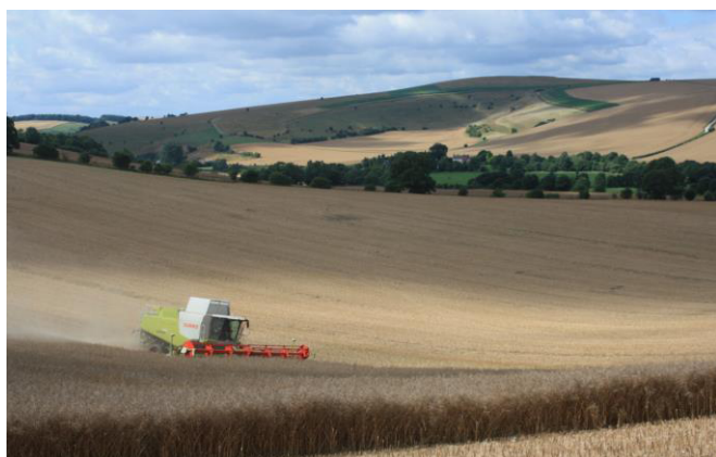
Harvesting rapeseed with views to Whitecliff Farm, Boar's Bottom and Cold Kitchen Hill by Peter Marsh

But a balance is needed between maintaining public access at a sustainable level, not overburdening a visually stunning countryside, and recognising that more visitors will not provide any significant additional revenue or advantage for the Parish. Warminster, in conjunction with Visit Wiltshire, markets the whole area to domestic and overseas visitors. Overall, the current balance (albeit informally arrived at) seems to be about right.