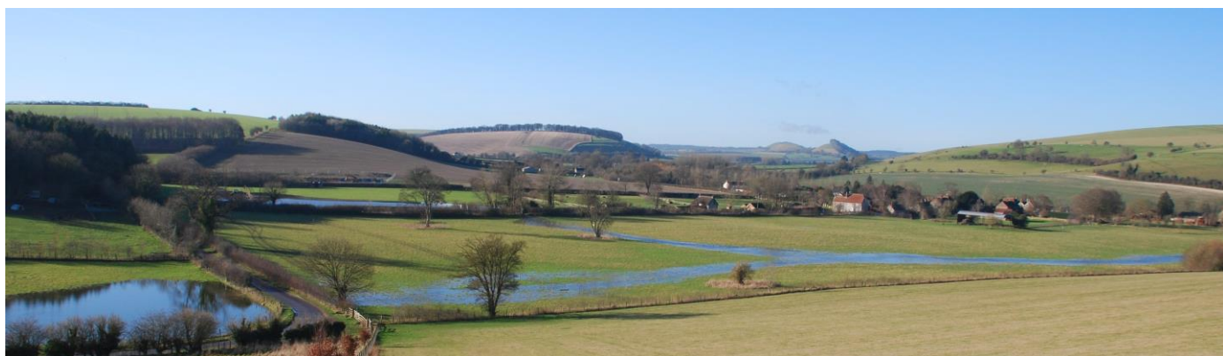
Winterbournes flowing at Monkton Deverill February 2014

Keysley Farmhouse Hedge Cottage Marvins Humphrey's Orchard Barn at Manor Farm Pope's Farmhouse and Flat Church of St Mary and Young monument Kingston House 35 Kingston Deverill 36 & 38 Kingston Deverill 39 Kingston Deverill