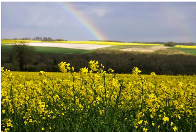
Spring Rainbow by Samantha Barber ©The Country Photographer

Residents look to grow a greater cohesiveness in all parts of the community and across all 3 villages, with the ability to accommodate a broad spectrum of attitudes and aspirations. There is a desire to encourage diversity in community engagement and for 'champions' to take forward specific interests.