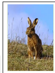
Hare on Keysley Down