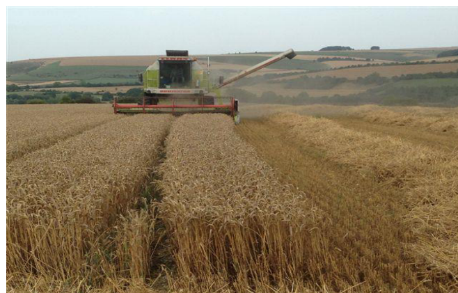
Gathering in the wheat on Brims Down by Ranald Blue