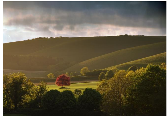
View to Bidcombe Down from Kingston Deverill

The initial questionnaire asked people for their views on the preservation and conservation of the villages and surrounding countryside. Residents were also asked what they thought about access to the countryside and about the River Wylfe that runs through all 3 villages in the Upper Deverills. Questions about access to the countryside addressed availability, suitability and maintenance of rights of way. The Upper Deverills is fortunate to be within an area well served by footpaths, bridleways and byways. The river is of major importance to the diversity of habitat it provides. But it also gives rise to concerns about fluctuating levels, maintenance and the occasional incidents of flooding and residents were asked to indicate their concerns, or otherwise, on these issues.