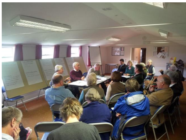
Discussion of the First Draft in the Village Hall 28 September 2013

rural economy on 10 June 2013; both drew satisfactory attendances in the Village Hall. The third, dealing with youth matters, was conducted on a one-to-one basis during August/September 2013.