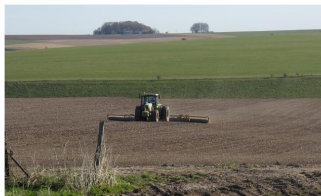
Preparation for seeding on Little Down – Parsonage Down beyond

with the highest percentages working in Agriculture, Forestry and Fishing (14%) and Human Health & Social Work Activities (also 14%).