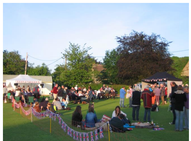
Celebrations for the Queen's Diamond Jubilee at the Village Hall June 2012