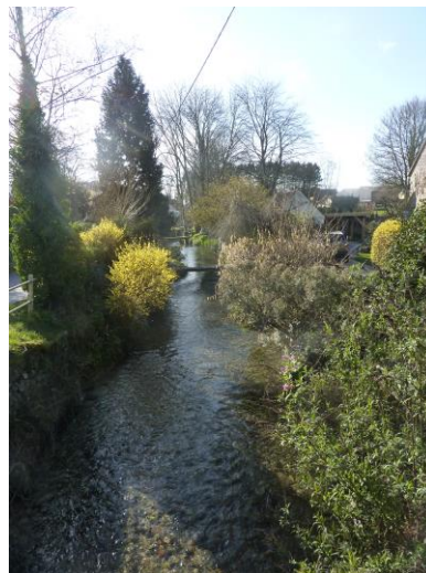
The river at Kingston Deverill