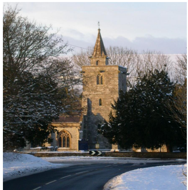
Kingston Deverill Church

Before the Reformation most of the land in the Parish was owned by the Church. Brixton Deverill manor was given to the Norman Abbey of St Mary of Bec-Hellouin by Queen Maud, wife of William the Conqueror, before her death in 1083. Monkton Deverill belonged to the Abbots of Glastonbury from the 10 th century until after the Reformation when the village was purchased by Sir John Thynne. It was sold in the 1940s to help pay death duties.