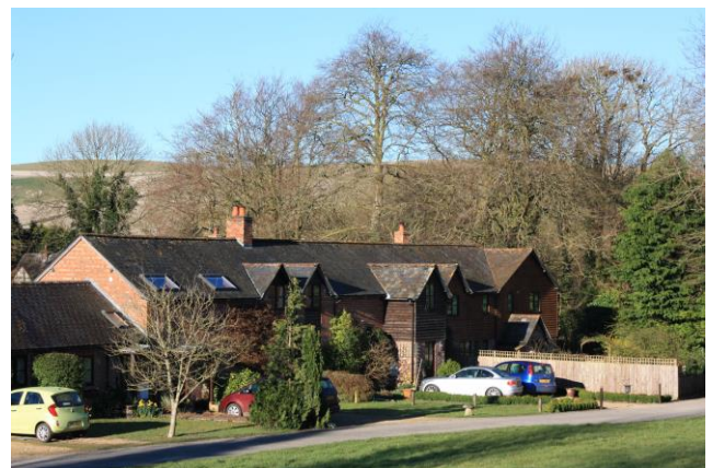
Sympathetic conversion of farm buildings at former Manor Farm, Brixton Deverill

There was some strong feeling about inappropriate development with negative comments about wind turbines, poor use of wood/glass/concrete in dwellings, largely arising from a few examples of development where the choice of materials and style is different to the more common types of building. Considerable interest was apparent to develop a Village Design Statement for the villages to address concerns and reflect community opinion. The Parish Council requested that the Working Group should take this forward as a separate piece of work, requiring additional consultation, and to form an addendum to the Parish Plan at a later date.