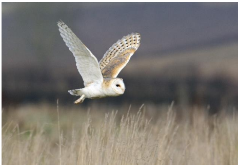
Barn Owl DROG (see Annex 2) is helping with the necessary conservation by providing & monitoring boxes throughout the valley