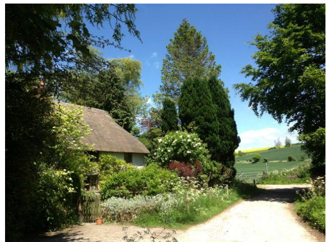
Dairy Cottage, Brixton Deverill

A Housing Needs Survey was conducted by Wiltshire Council Housing Strategy Team in April/May 2013. The response to this survey was smaller than that for the Parish Plan survey and although it addressed some different issues, there were some common themes related to housing development. The Parish Plan Working Group was consulted and commented on the draft report. Data and comments from the Parish Plan survey were provided so that, where appropriate, the Wiltshire Council Strategy Team could ensure consistency in reporting community views.