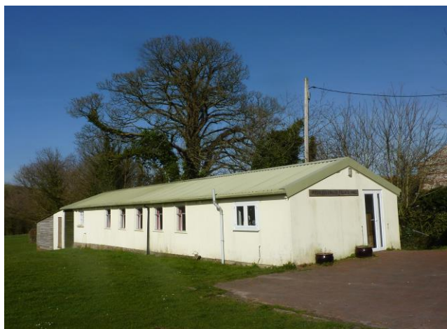
Upper Deverills Village Hall by Andrea Llewellyn

The Upper Deverills Village Hall is a simple single storey building of light weight construction built in the 1950s. In recent years a number of improvements have been carried out including a hard standing area, an extension to provide better toilets and storage, a newly fitted kitchen and redecoration.