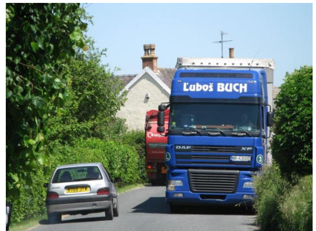
Unwelcomed lorries - © Albert Lee

Agency has completed road layout/signage changes on the A303 that will provide an alternative route for heavy vehicles.