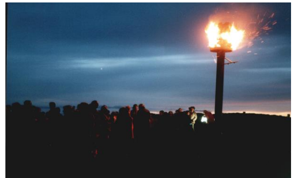
The beacon alight to celebrate the Queen's Golden Jubilee June 2002 by Jeff Cox