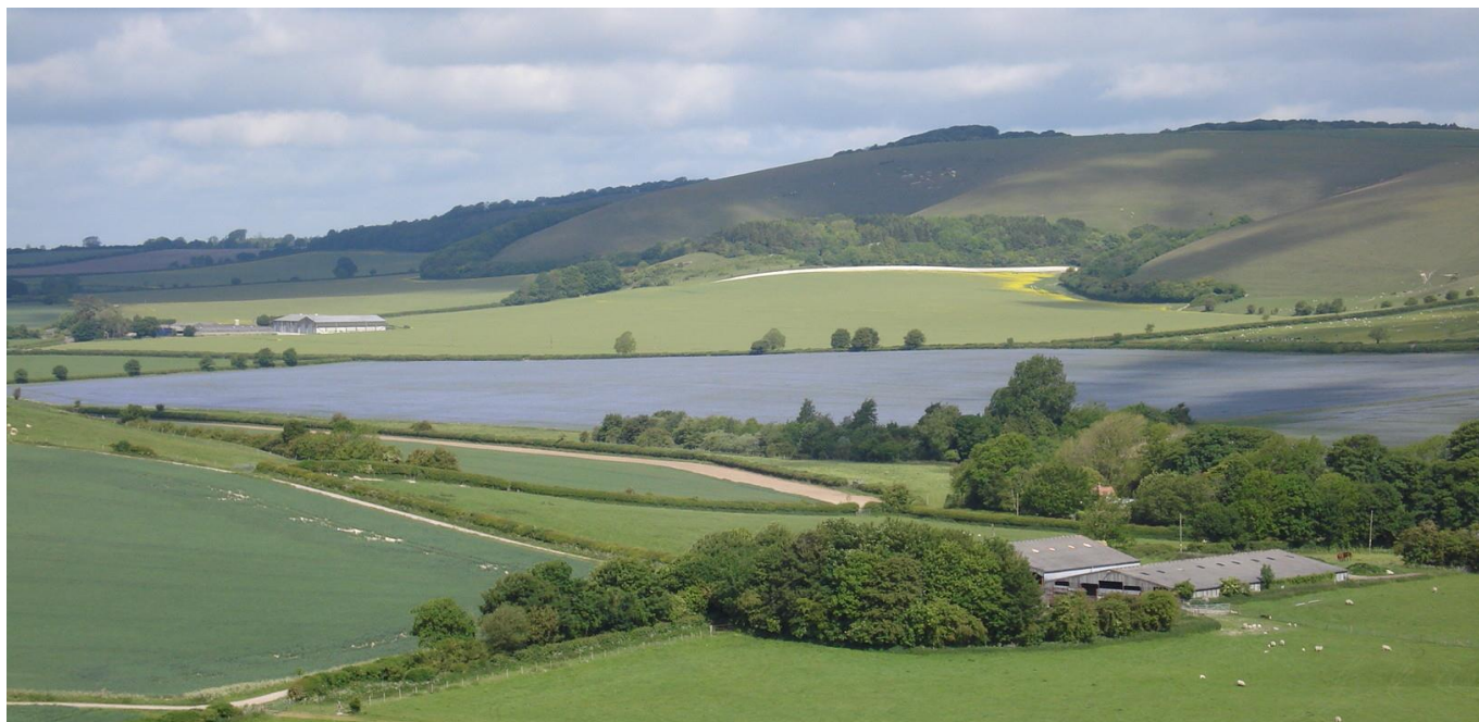
Kingston Lake? – nay, a field of flax/ linseed betwixt Kingston Dairy and Bidcombe Down